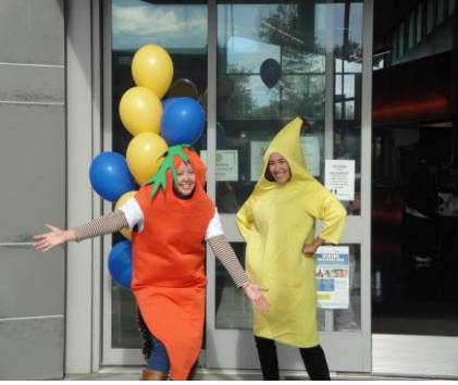
Yum! Nutrition/Social Work students